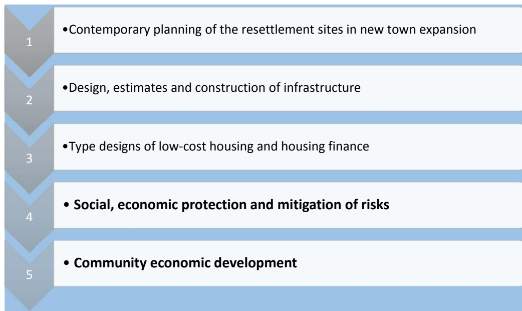
Figure 1: Five areas of Technical Assistance

Research undertaken during the inception phase will build on findings from UN-Habitat’s mapping assessment conducted in cooperation with YCDC that identified/verified 423 slum/informal settlements within municipal boundaries. The slum mapping classified informal settlements into seven typologies based on their location and/or development and qualitative socio-economic research on urban poverty and living conditions in Yangon’s informal settlements. 1