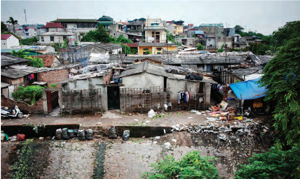
Hanoi, Viet Nam.

As Asia-Pacific continues to urbanize, many of the region's development challenges – job creation and poverty reduction, governance and access to services, climate change and environmental sustainability – will be focused in its cities. The coming years will see massive physical, economic and social change, local and global climate consequences. What is clear is that the growth of cities will continue and successfully managing city growth will be critical to development outcomes and social stability. The future prospects for people in Asia-Pacific cities will be determined by the development response to rising urban poverty, inequality and vulnerability to climate change.