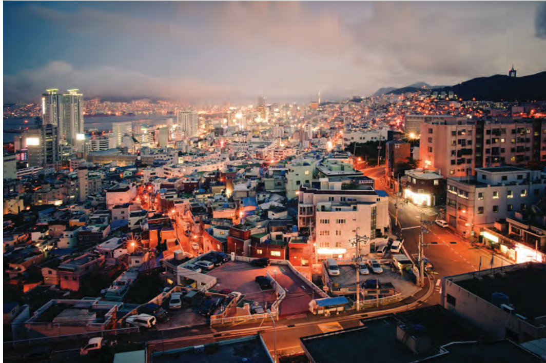
Busan, Republic of Korea.