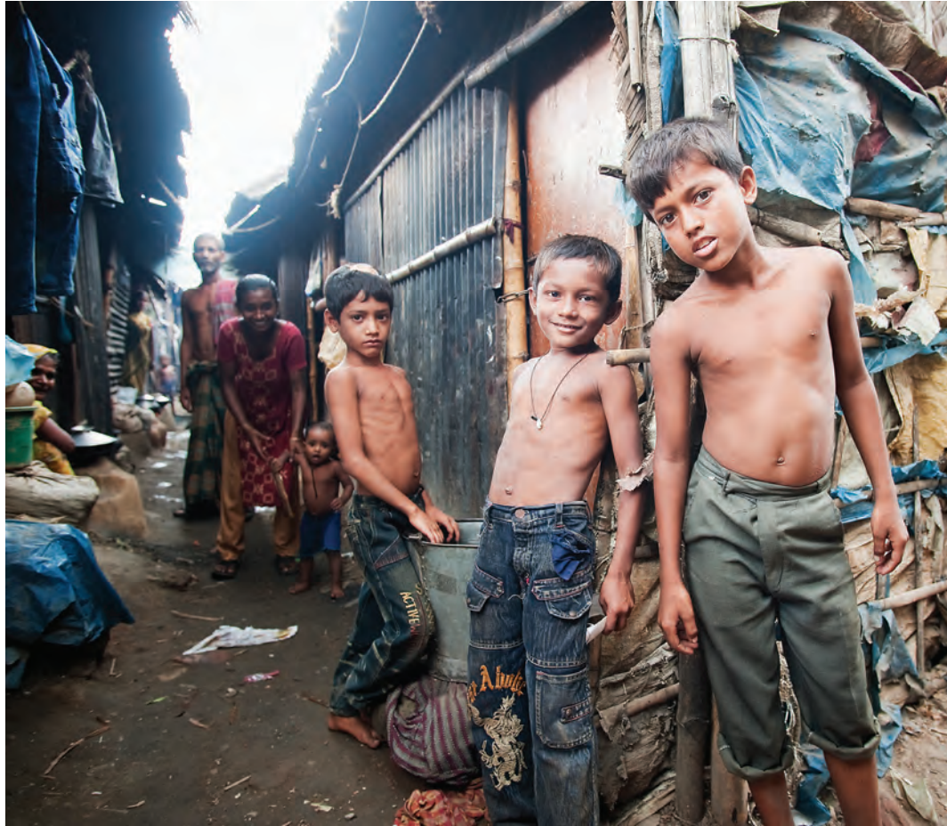
Dhaka, Bangladesh.

Urban poverty often stands neglected in policy-making in the region, given the historical levels of rural poverty. This bias persists even today in many countries, which look at urban poverty as a marginal issue. However, interest in urban poverty issues is increasing as a result of efforts to see poverty beyond income, including the issues of risks and vulnerability, structural inequalities, governance dimensions and inter-generational transmission of poverty. Vulnerability originates from different sources ranging from short-term external shocks, to long-term structural challenges, to achieving sustainable poverty reduction and human development in the urban context. The urban poor are primarily vulnerable to shocks and stresses due to limited access to traditional or informal safety net arrangements or coping mechanisms in times of stress or need. Nevertheless, the exclusive focus on income poverty risks overlooking the underlying causes of vulnerability, which revolve around social and environmental dimensions.