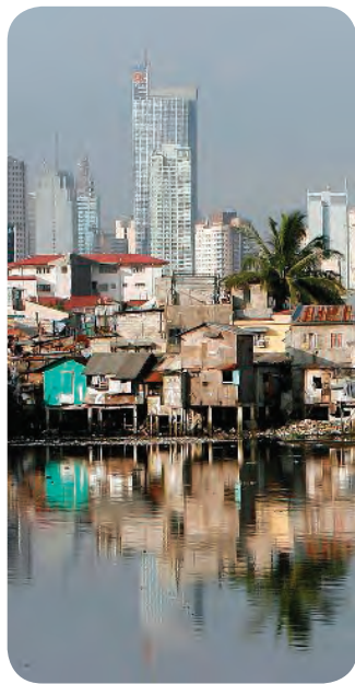
Manila, Philippines.